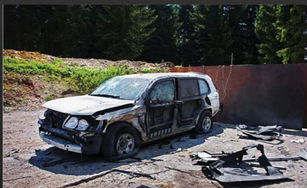
European Armour Technology

The 360° protection of a Manila Protection vehicle is based on the "cocoon principle". Just like a cocoon, we encase the passengers in a protective shield to prevent or minimize damage inflicted by an attack.